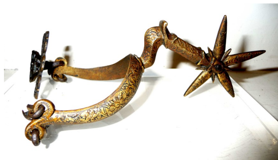
Sir Roger Manwood's achievements: helm, crest, and sword; gauntlet and spur.